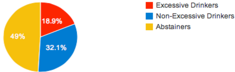
Distribution of Alcohol Consumption Among Adults (age 18+) in New Mexico's Population

Source: Center for Disease Control's 2011 Behavioral Risk Factor Surveillance System survey of adults aged 18 years and older.